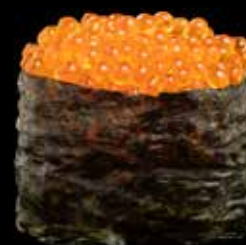
LAKSEROGN kr. 60,- Allergener: F