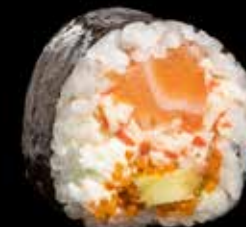
SPESIAL FUTOMAKI kr. 180,-

Laks, tobiko, crabstick, kremost, avocado