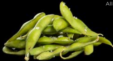
EDAMAME BØNNER MED HAVSALT kr. 65,-