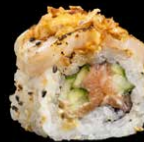
TSUBAKI MAKI kr. 205,-

Laks, agurk, kamskjell, sprøstekt løk, miso dressing.