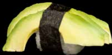
NIGIRI AVOCADO kr. 25,- pr. bit Allergener: SE