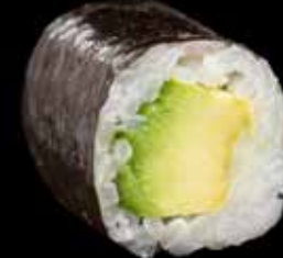
HOSO MAKI / 6 biter Hoso maki med avocado kr. 75,- Allergener: SE