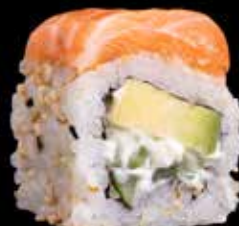
PHILADELPHIA MAKI kr. 165,-