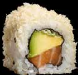
LAKS OG CRUNCHY kr. 160,- Laks, avocado, chilimayones, crunchy. Allergener: G, F, S, SE, E