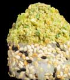
GREEN RIVER MAKI kr. 175,- Laks, chilimayones, wasabipeanøtter og wasabierter. Allergener: G, F, E