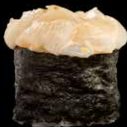
KAMSKJELL Chilimayones kr. 55,- Allergener: F, SK, E, B