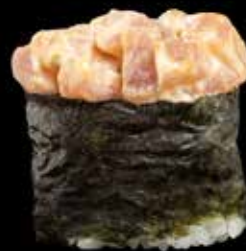
TUNFISK Chilimayones kr. 45,- Allergener: F, E