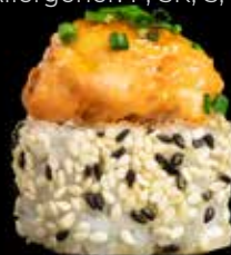
BAKT MAKI kr. 190,- Laksetartar, crabstick, chilimayones, masago, agurk, avocado. Allergener: G, F, SK, S, E