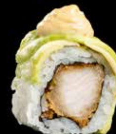
GREEN CHICKEN MAKI kr. 185,- Kylling, avocado, nøttdressing. Allergener: G, S, SE, E, N