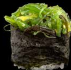
WAKAME kr. 35,- Allergener: F, SE