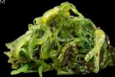
WAKAME SJØGRØNNSAK SALAT kr. 70,- Allergener: SE