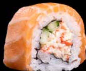
FUDZIJAMA MAKI kr. 190,-

Laks, crabsticks, masago, agurk, chilimayones.