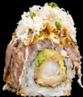
BIFF MAKI kr. 240,-

Biff, tempura scampi, avocado, fersk pepperot, sprøstekt løk, wasabi saus.