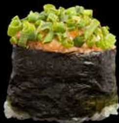
LAKS Masago, chilimayones kr. 40,- Allergener: F, E