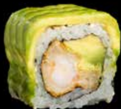
AVOCADO MAKI kr. 185,- Tempura scampi, avocado. Allergener: G, SK, S, SE