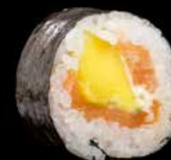
MANGO MAKI kr. 185,-