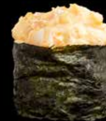
SCAMPI Chilimayones kr. 45,- Allergener: F, SK, E