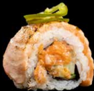
FLAMBERT JALAPENO MAKI kr. 205,-

Laks, masago, agurk, chillimayones, syltet jalapeno, jalapeno emulsjon.