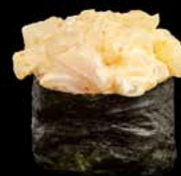
KVEITE Chilimayones kr. 45,- Allergener: F, E