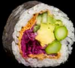
VEGETAR MAKI / 8 biter Lages av sesongens grønnsaker kr. 130,- Allergener: G, SE