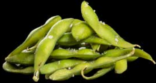
EDAMAME BØNNER MED HAVSALT