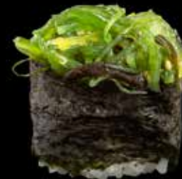
GUNKAN WAKAME kr. 35,- Allergener: SE