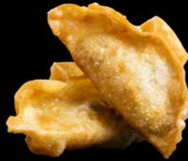
GYOZA MED KYLILING 6 stk.