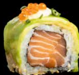
TRØFFEL MAKI kr. 195,-

Laks, avocado, trøffel dressing, lakserogn, røkt unagi.