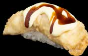
NIGIRI WASABI KVEITE