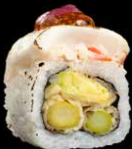
FLAMBERT KVEITE MAKI kr. 205,-

Kveite, tempura asparges, crabstick, avocado, ponzo og rødløk emulsjon, masago.