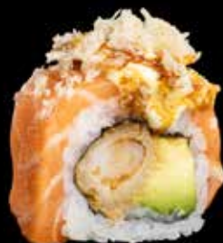
SAKURA MAKI kr. 195,- Laks, tempura scampi, avocado, wasabi saus, crunchy. Allergener: G, F, SK, S, SE, M