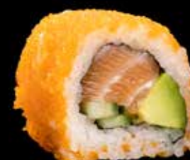
ALASKA MAKI kr. 180,-