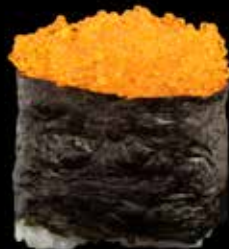
TOBIKO kr. 50,- Allergener: F