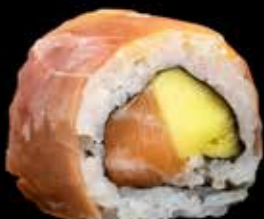
SERRANO MAKI kr. 185,-

Laks, mango, chilimayones, serrano skinke