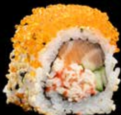
CALIFORNIA FUTOMAKI kr. 165,-

Tobiko, laks, avocado, crabsticks, agurk, masago.