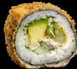
TEMPURA VEGETAR / 8 biter Asparges, agurk, avocado, kremost kr. 140,- Allergener: G, SE, S, M