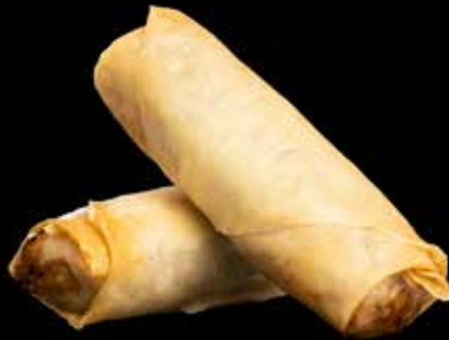
2 stk. VÅRRULL MED KYLING ELLER GRØNNSAKER - MED SHITAKESOPP