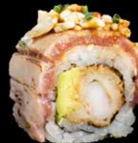
FLAMBERT TUNA kr. 205,-

Tuna, tempura scampi, avocado, kimchinøtter, røkt unagi.