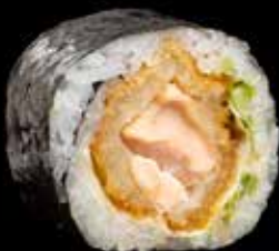
CRISPY LAKS kr. 160,-

Tempura laks, ingefær, chilimayones, vårløk