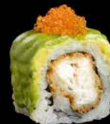
TERIYAKI KVEITE kr. 190,- Tempura kveite, avocado, tobiko, teriyaki saus. Allergener: G, F, S, SE