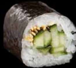
HOSO MAKI / 6 biter Hoso maki med agurk kr. 75,- Allergener: SE