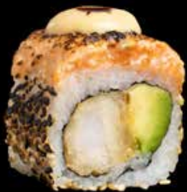
TARTAR MAKI kr. 195,-

Laksetartar, tempura scampi, masago, avocado, miso dressing, chillimayones.