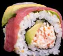
RAINBOW MAKI kr. 195,- Laks, tuna, scampi, kveite, avocado, kamskjell, crabstick, lakserogn, agurk, masago. Allergener: F, SK, S, SE, E, B