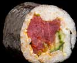
KIM-CHI MAKI kr. 185,- Kimchi saus, tuna, vårløk, agurk. Allergener: F, SE, E