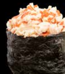
CALIFORNIA / CRABSTICK Masago, chilimayones kr. 45,- Allergener: F, SK, E